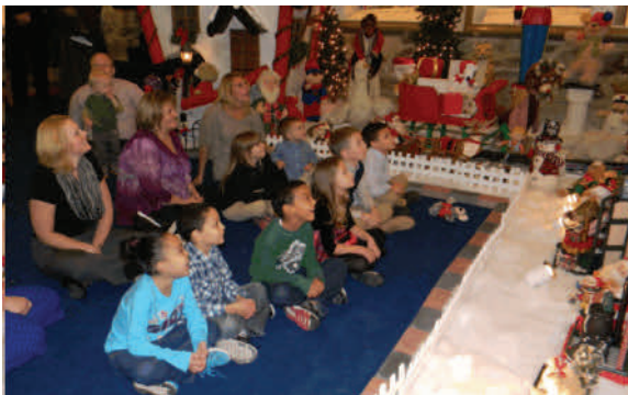
Parents and children share the magic of Pip!