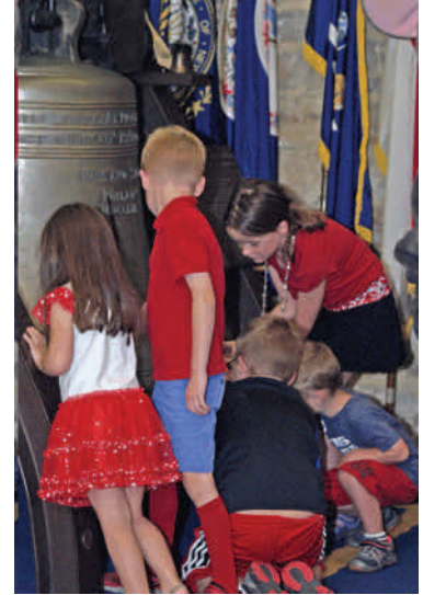
Up close and personal with history.

We know that you feel the same passion to preserve our history and the symbols of freedom for future generations. Your thoughtful support and generous contribution help us share our unique history as well as provide new exhibits and programs.